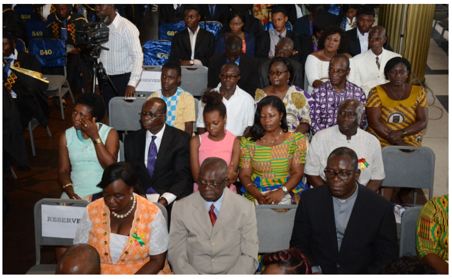
Some parents, guardians and invited guests at the ceremony