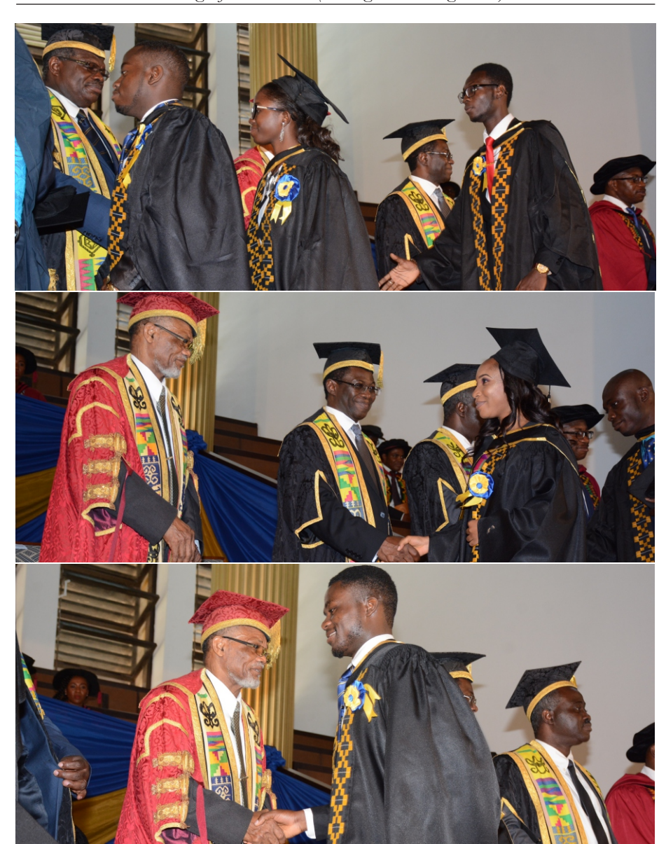
Graduands being congratulated by Officials and Dignitaries