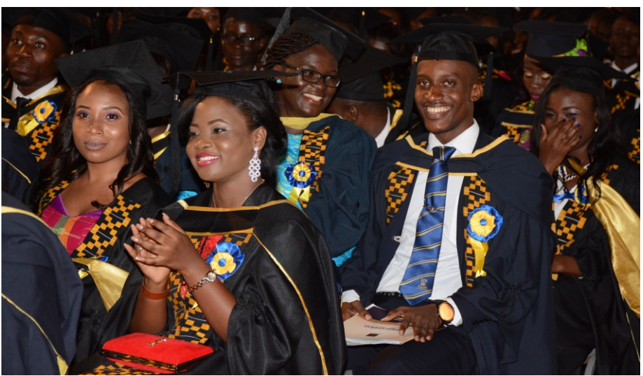
Graduands seated at the Congregation ceremony